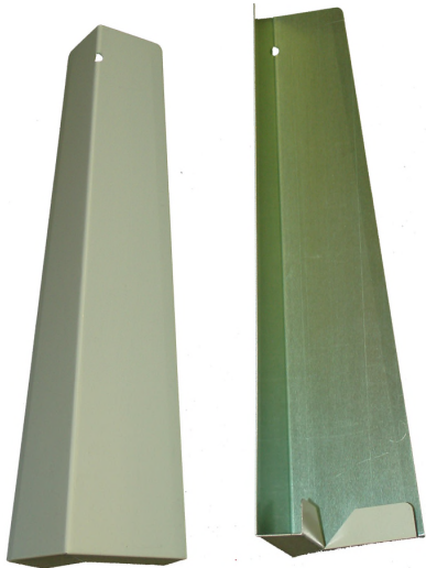
299 Series Corners

The 299 Series Artisan® Lap Siding corners are designed to accentuate the shadow line and thickness of the Artisan® Lap siding. Manufactured with a full wraparound lower lip, these corners require no bottom nail and are easily installed after the Artisan® Lap is hung. Complementing the quality of Artisan® siding, the material used is heavy .019" aluminum, primed and ready for paint on the outside and coated for full protection on the inside. The 299 Series corners are available to fit all Artisan® Lap siding sizes, in both smooth and wood grain textures. To ensure complete coverage of the thick Artisan® siding, the corners are a full 2" wide at the bottom, tapering down to 1-3/8" at the top to create a continuous edge line.